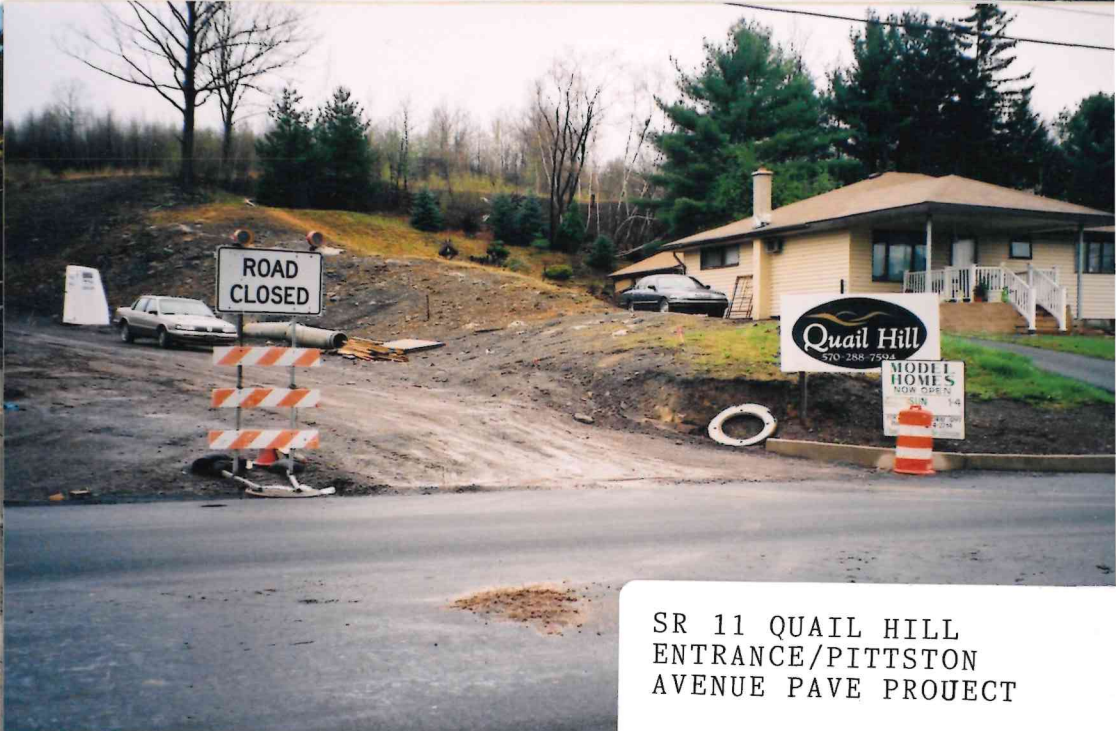
SR 11 QUAIL HILL ENTRANCE/PITTSTON AVENUE PAVE PROJECT