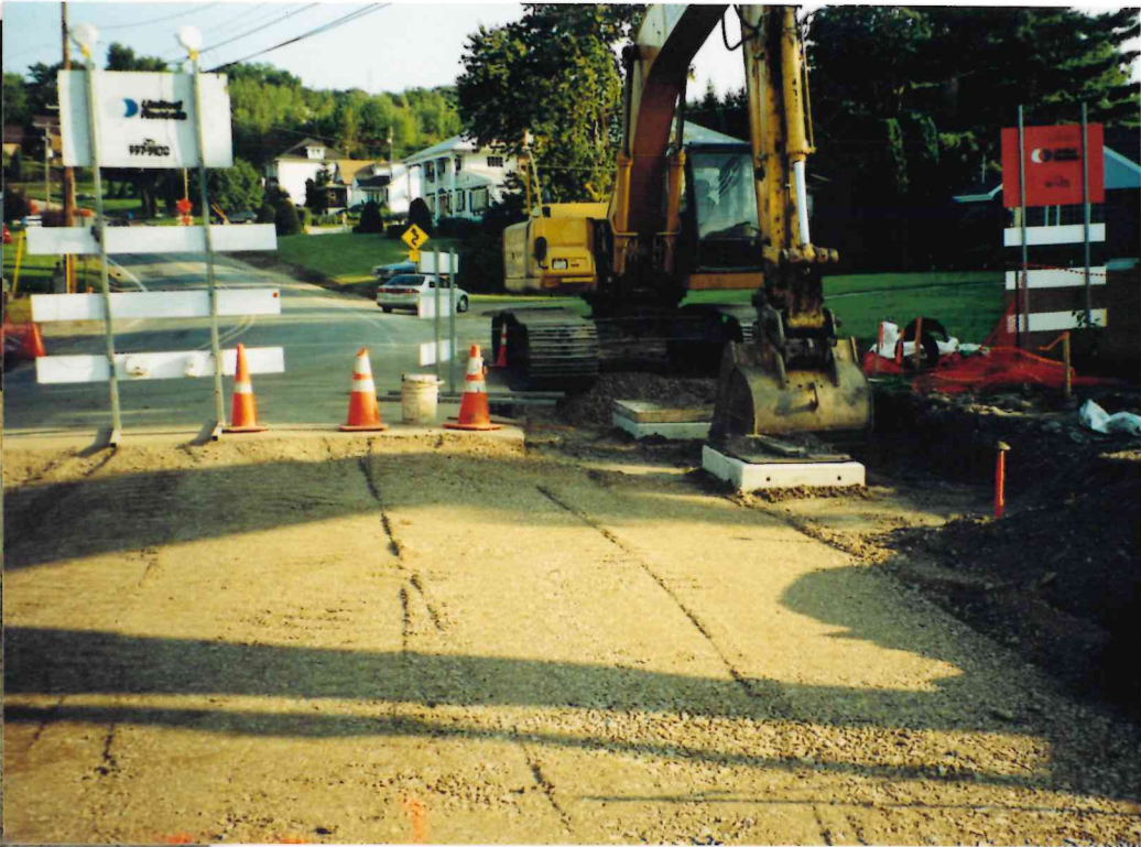
BEAR CREEK ROAD CHESTNUT STREET INTERSECTION RECONSTRUCTION/ TRAFFIC SIGNAL UPGRADE